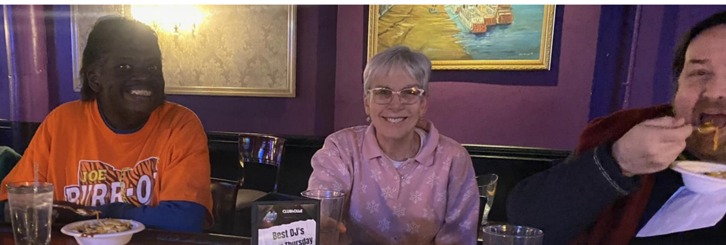
Members judging chili at our annual chili cook-off